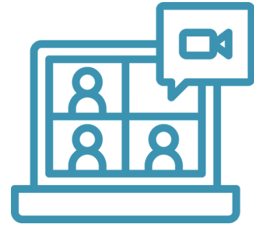
1.5-Hour Virtual Consultation