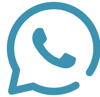
WhatsApp & Call Support