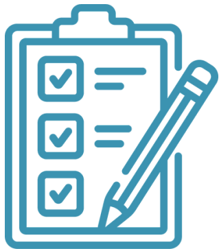
Sleep Patterns Evaluation

We empower parents to teach their babies to sleep better with: