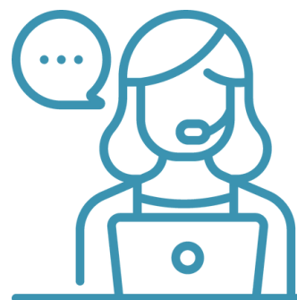
20-Min Future Support Call

We're all about using proven and evidence-backed approaches that respect your baby's needs and your parenting instincts.