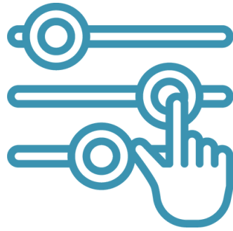
Personalised Sleep Plan