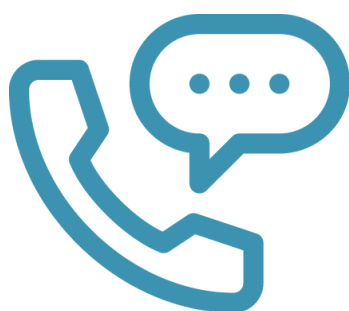
15-Min Closing Call