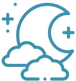
First Night Virtual Support