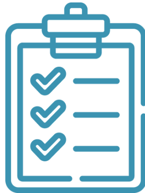
Sleep Log Template & Monitoring